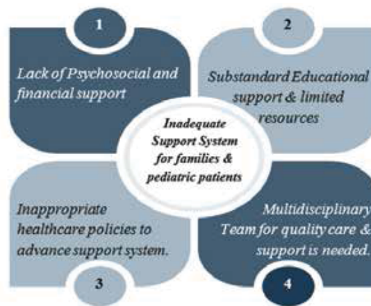
Figure 2. Summary of findings.